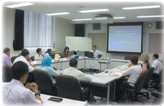
ining for soil contamination countermeasures