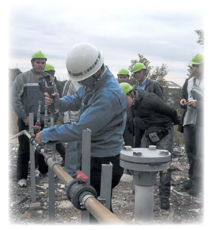
Study-tour of a gas detecting operation

Aiming to develop human resources in the field of environmental protection, ICETT provides training programs for government officials, engineers and researchers from various countries focusing on Japan's environmental policy and framework, and leading technologies. ICETT organizes training programs in Japan as well as overseas.