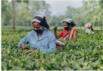
Corporate Human R...