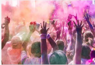
Universal Human Ri...