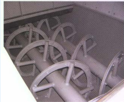
Biaxial Ribbon Mixer